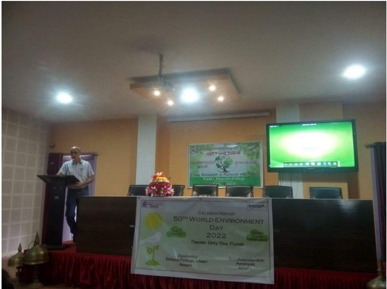
4.3. Talk on Environmental Degradation and It's Impact on Health Economy organized by Department of Economics, Dimoria College on 23 rd December, 2021.