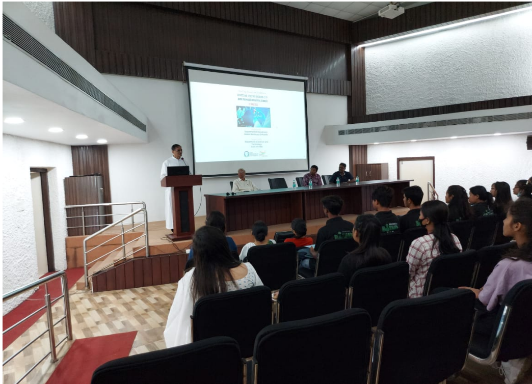
Student's exchange program (Deptt. of Botany, Dimoria College, Khetri) at Assam Don Bosco University, 26 th June 2022