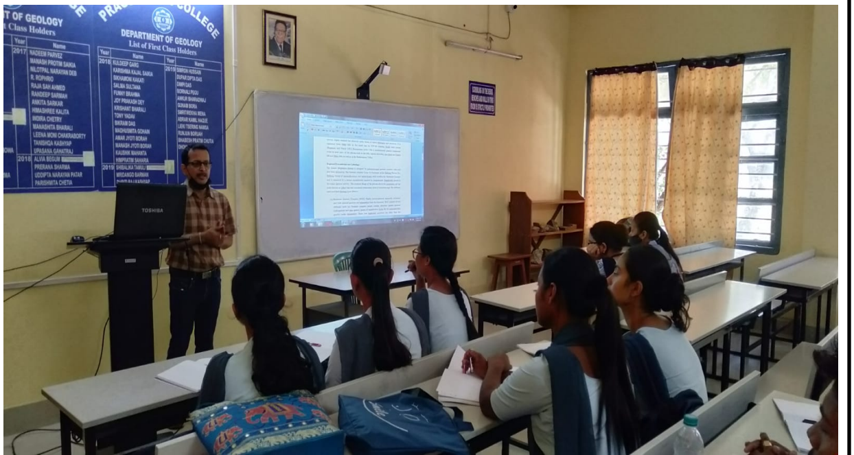
Student's exchange program (Deptt. of Geology, Dimoria College, Khetri) at Pragjyotish College, Guwahati, March 2022