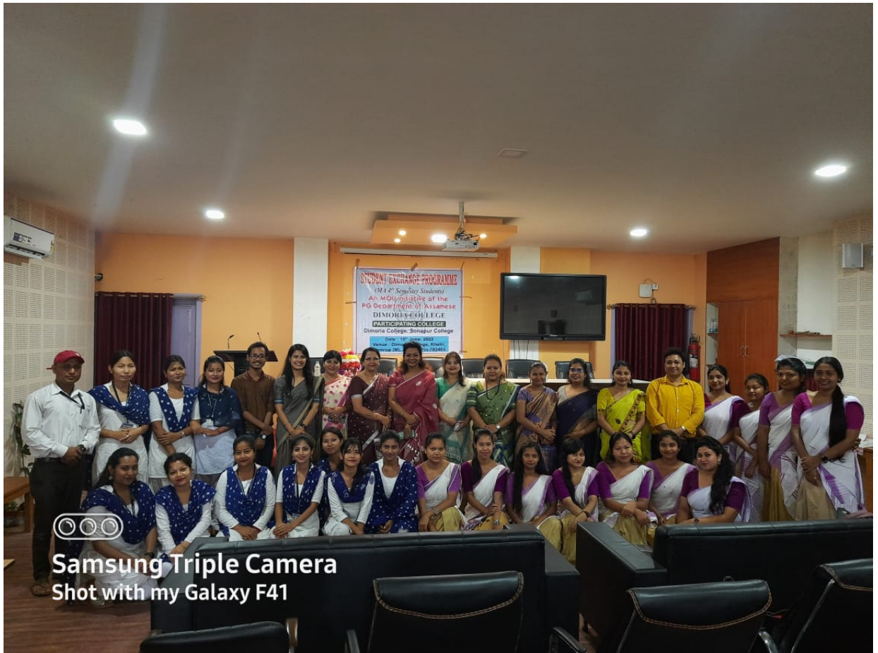
Student's exchange (Deptt. of Assamese, Sonapur College, Sonapur Assam) at Dimoria College, Khetri on 10/06/2022