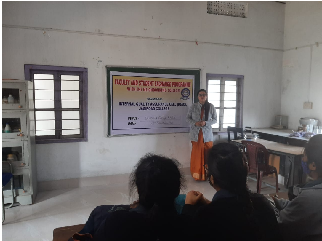
Faculty exchange (Deptt. of Botany, Jagiroad College, Assam) at Deptt. of Botany, Dimoria College, Khetri, 22 Dec 2021