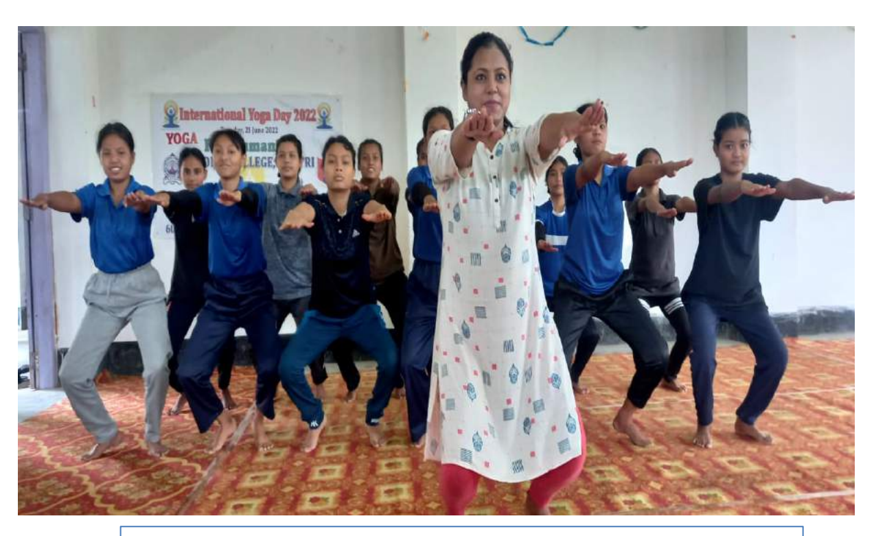
Yoga Day, 21st June 2022 by 60 Assam Girls BN NCC