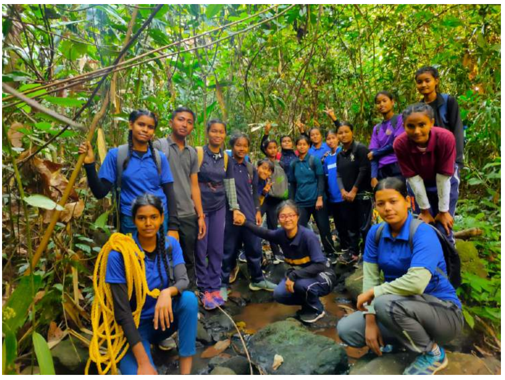
Trekking Camp by 60 Assam Girls BN NCC on 9<sup>th</sup> Jan 2022