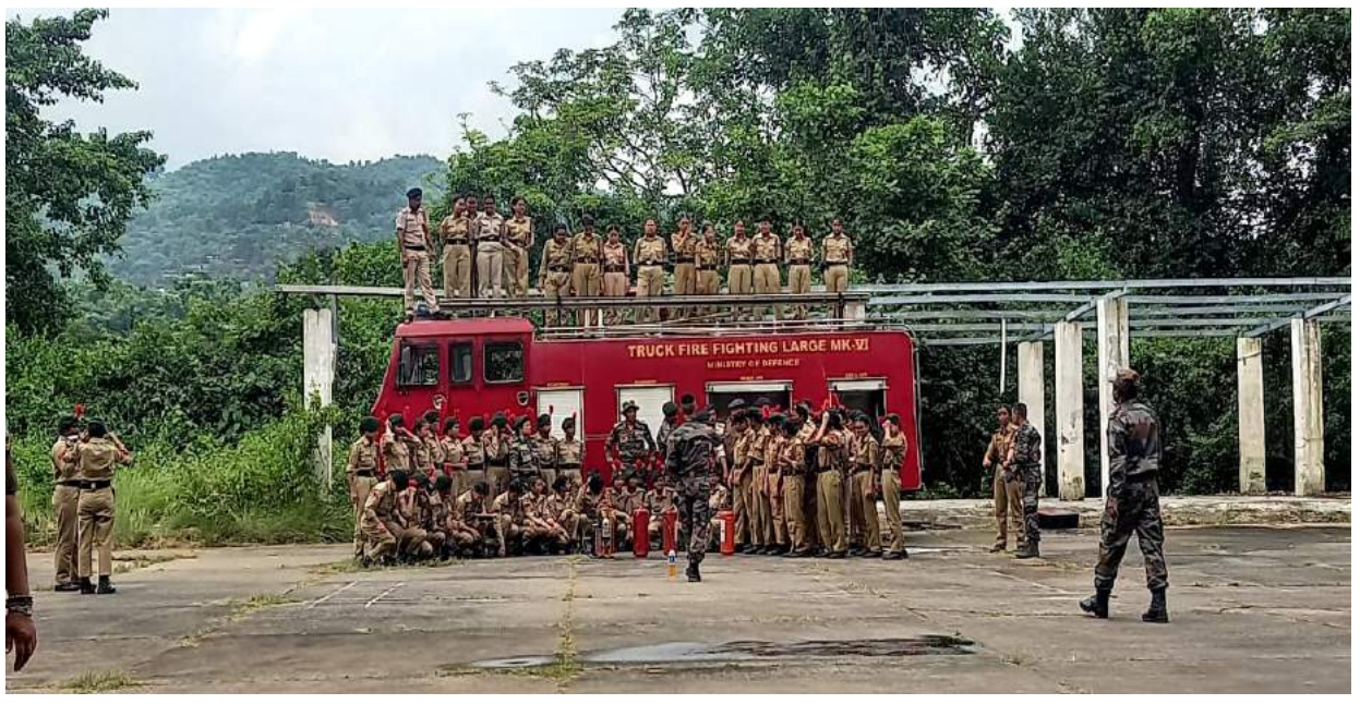
Fire-fighting training to 60 Bn NCC at Narengi Army Camp, Guwahati, Assam Date: 26/06/2022