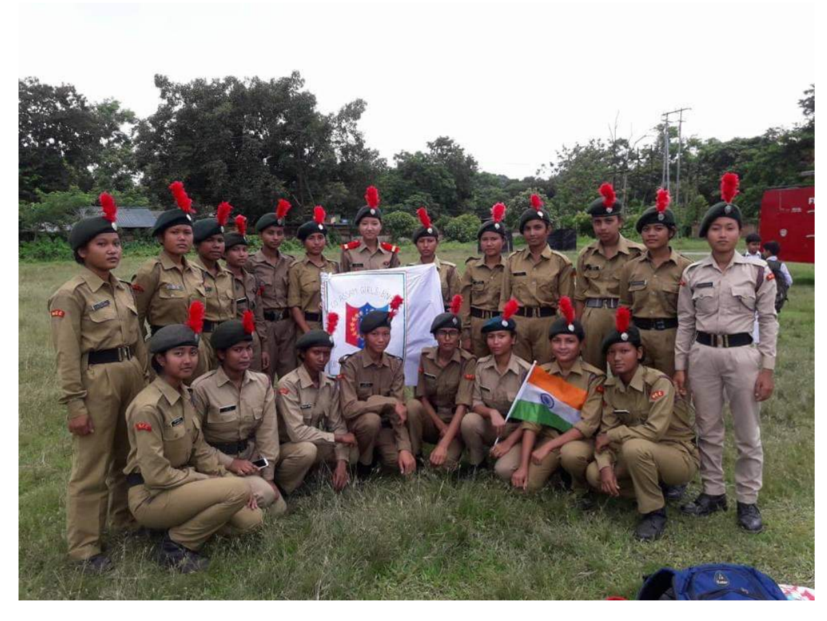
60 Bn NCC at Independence Day Program, 15th Aug 2020