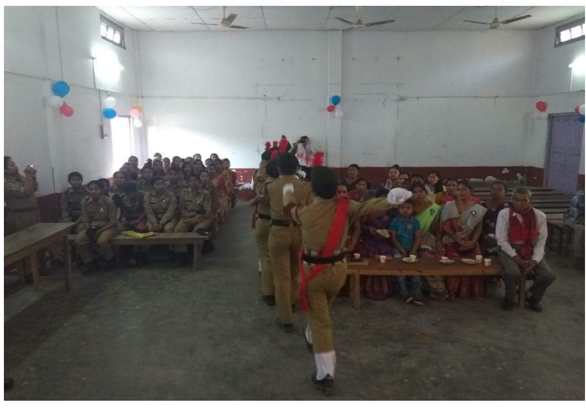
NCC Day by 60 Bn NCC at Dimoria College, Khetri 24 th Nov, 2019