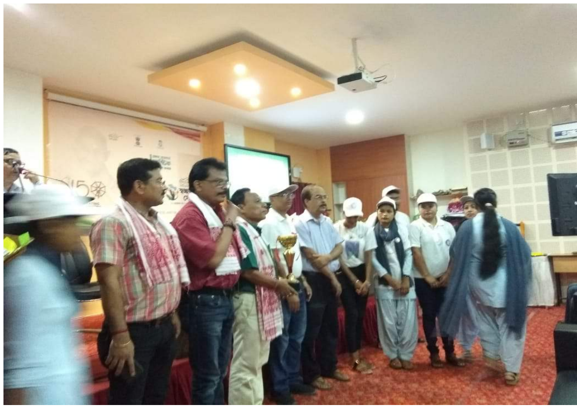
Gandhi Jayanti Celebrations by 60 Bn NCC at Dimoria College, Khetri on 2<sup>nd</sup> Oct, 2019