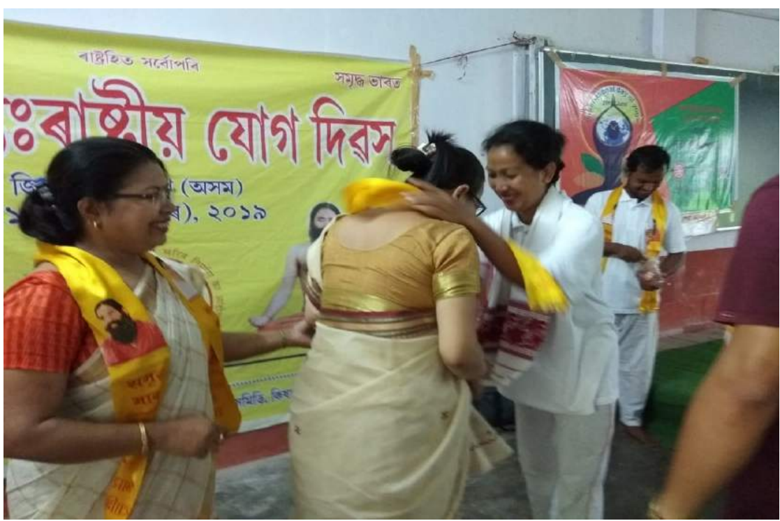
Yoga Day, 21<sup>st</sup> June 2019 by 60 Assam Girls BN NCC in collaboration with NSS, Dimoria College Unit