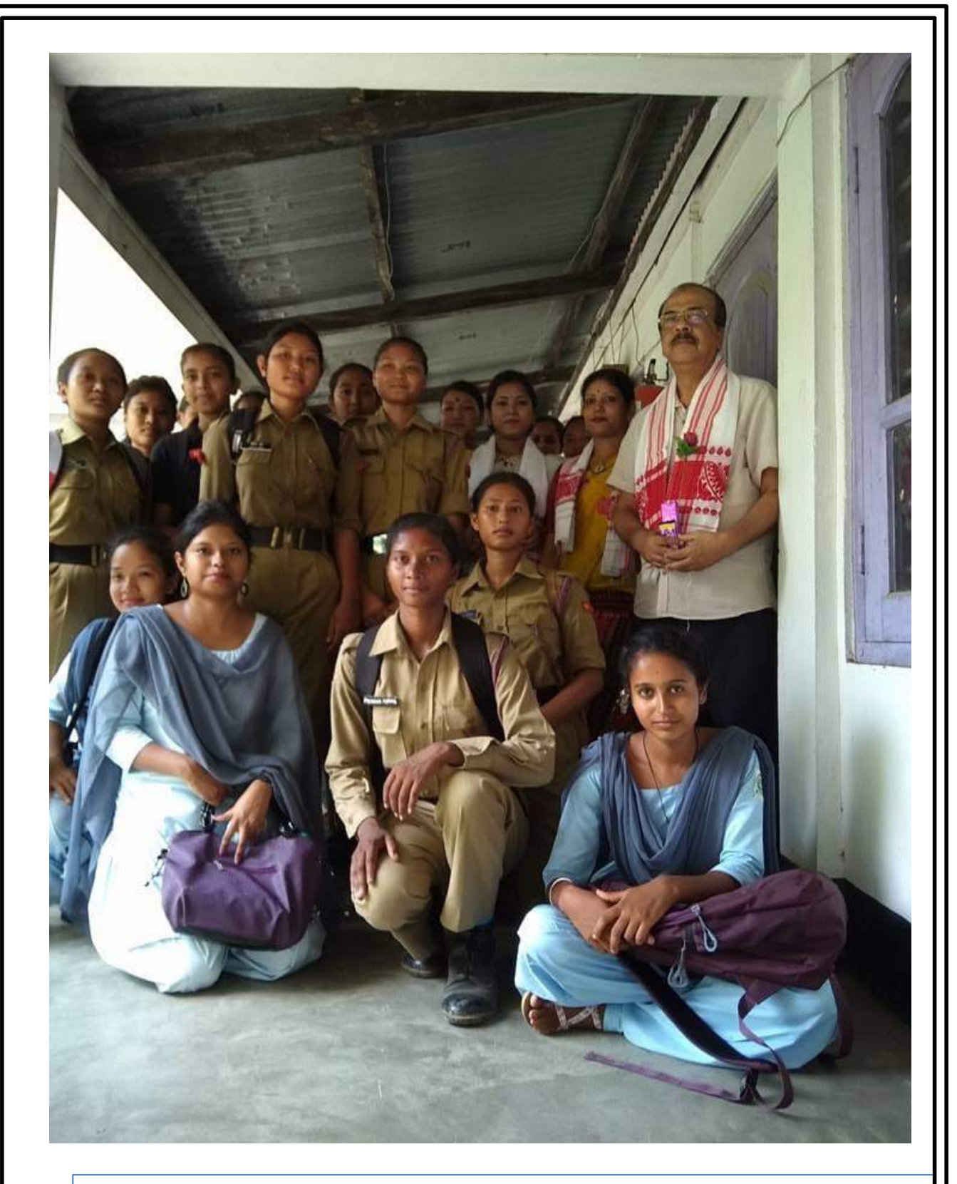
60 Bn NCC celebrating Teachers Day Program on 5<sup>th</sup> Sept 2018