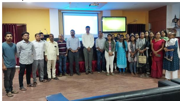
Group Photo of the Program